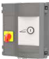
Classic Plus (standard)

The dock leveller is operated via the control system type Classic Plus included as standard. The components of the control system are RoHS-compliant (unleaded).